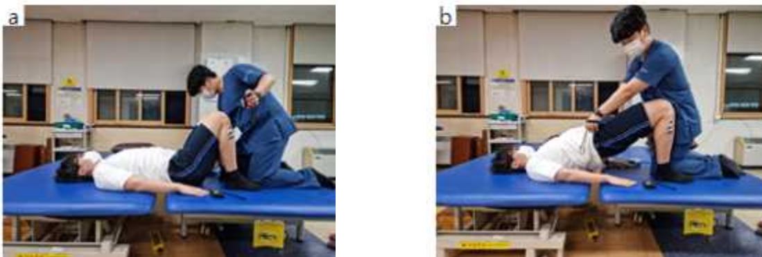
Figure 2. isometric contraction bridge exercise : (a) Before the isometric contraction bridge exercise (0.5%, 1%, 1.5%/BW) (b) During the isometric contraction bridge exercise (0.5%, 1%, 1.5%/BW)

After the therapist applies resistance to the anterior superior iliac spine area while the participant maintains the bridge exercise posture, he/she applies manual resistance using both hands and measures the isotonic contraction. Manual resistance equivalent to 0.5%, 1%, or 1.5% of body weight was displayed visually on a digital myometer(Jtech Commander Echo, JTECH Medical, USA) (Figure 3).