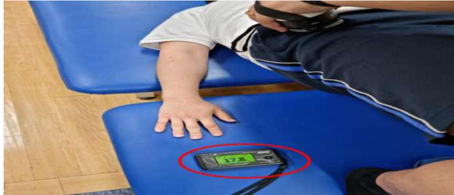
Figure 3. Manual resistance equivalent to 0.5%, 1%, or 1.5% of body weight was displayed visually through the myometer.