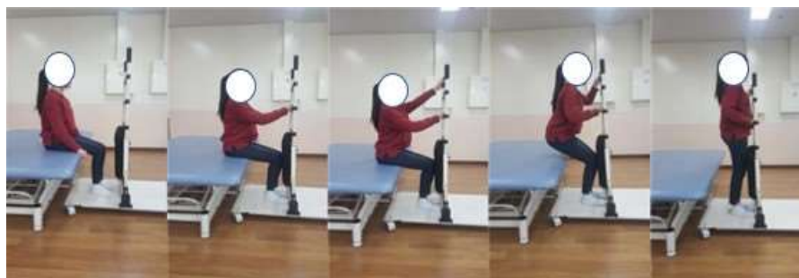
Figure 3. Feasibility test of sit-to-stand transfer assistive device

In this study, a feasibility test of the sit-to-stand transfer assistive device was conducted on 10 healthy adults. After having the participants use the developed sit-to-stand transfer assistive device, a short interview was conducted to investigate the device's feasibility (Figure 3). The subjects were asked what was inconvenient about the device when using the sit-to-stand transfer assistive device.