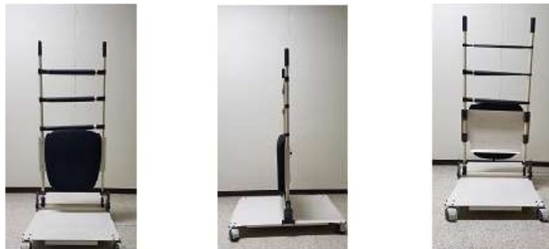
Figure 2. Sit-to-stand transfer assistive device

The movable part has four wheels so that it can be moved after standing up, and the support stand has a structure of two columns so that the user can hold it with his or her arms when standing up. The connective part is adapted to fix the support stand with the movable part or to change the angle of the support stand. (Figure 2).